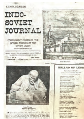
Fig. 20 – Special Issue on Lenin of the Indo-Soviet Journal.