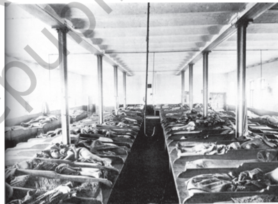
Fig.6 – Workers sleeping in bunkers in a dormitory in pre-revolutionary Russia.

Many survived by eating at charitable kitchens and living in poorhouses.