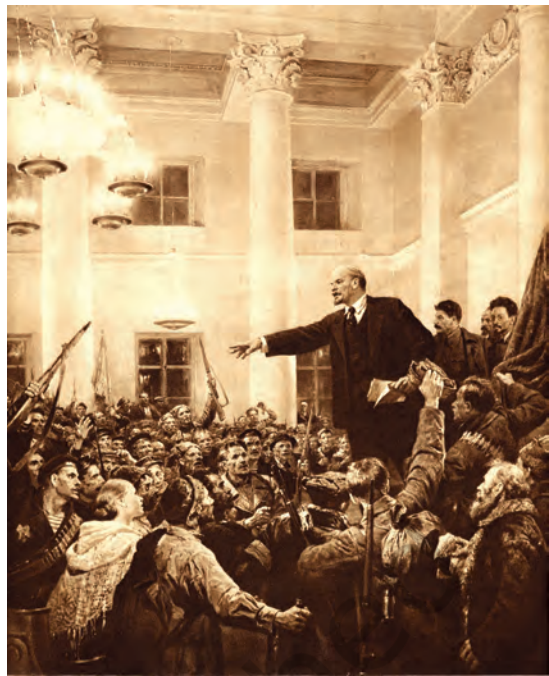
Fig.9 – A Bolshevik image of Lenin addressing workers in April 1917.

Meanwhile in the countryside, peasants and their Socialist Revolutionary leaders pressed for a redistribution of land. Land committees were formed to handle this. Encouraged by the Socialist Revolutionaries, peasants seized land between July and September 1917.