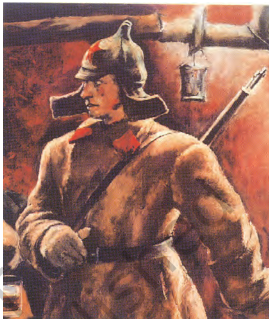
Fig. 12 – A soldier wearing the Soviet hat (budeonovka).

The Bolshevik Party was renamed the Russian Communist Party (Bolshevik). In November 1917, the Bolsheviks conducted the elections to the Constituent Assembly, but they failed to gain majority support. In January 1918, the Assembly rejected Bolshevik measures and Lenin dismissed the Assembly. He thought the All Russian Congress of Soviets was more democratic than an assembly elected in uncertain conditions. In March 1918, despite opposition by their political allies, the Bolsheviks made peace with Germany at Brest Litovsk. In the years that followed, the Bolsheviks became the only party to participate in the elections to the All Russian Congress of Soviets, which became the Parliament of the country. Russia became a one-party state. Trade unions were kept under party control. The secret police (called the Cheka first, and later OGPU and NKVD) punished those who criticised the Bolsheviks. Many young writers and artists rallied to the Party because it stood for socialism and for change. After October 1917, this led to experiments in the arts and architecture. But many became disillusioned because of the censorship the Party encouraged.