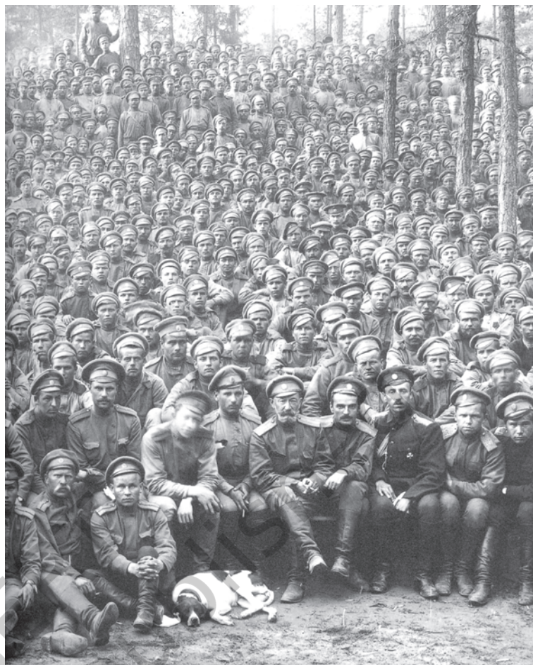
Fig. 7 – Russian soldiers during the First World War.

The war also had a severe impact on industry. Russia's own industries were few in number and the country was cut off from other suppliers of industrial goods by German control of the Baltic Sea. Industrial equipment disintegrated more rapidly in Russia than elsewhere in Europe. By 1916, railway lines began to break down. Able-bodied men were called up to the war. As a result, there were labour shortages and small workshops producing essentials were shut down. Large supplies of grain were sent to feed the army. For the people in the cities, bread and flour became scarce. By the winter of 1916, riots at bread shops were common.