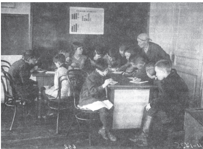
Fig. 15 – Children at school in Soviet Russia in the 1930s. They are studying the Soviet economy.