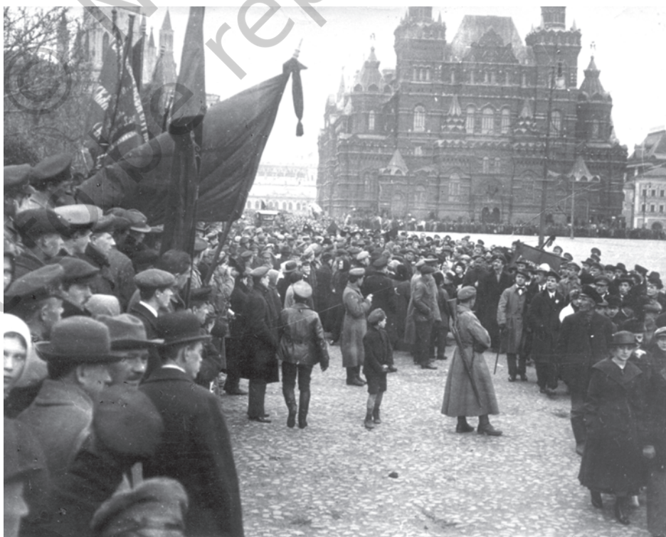
Fig. 13 – May Day demonstration in Moscow in 1918.