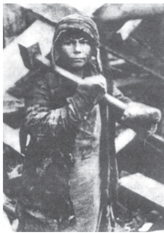
Fig. 16 – A child in Magnitogorsk during the First Five Year Plan. He is working for Soviet Russia.