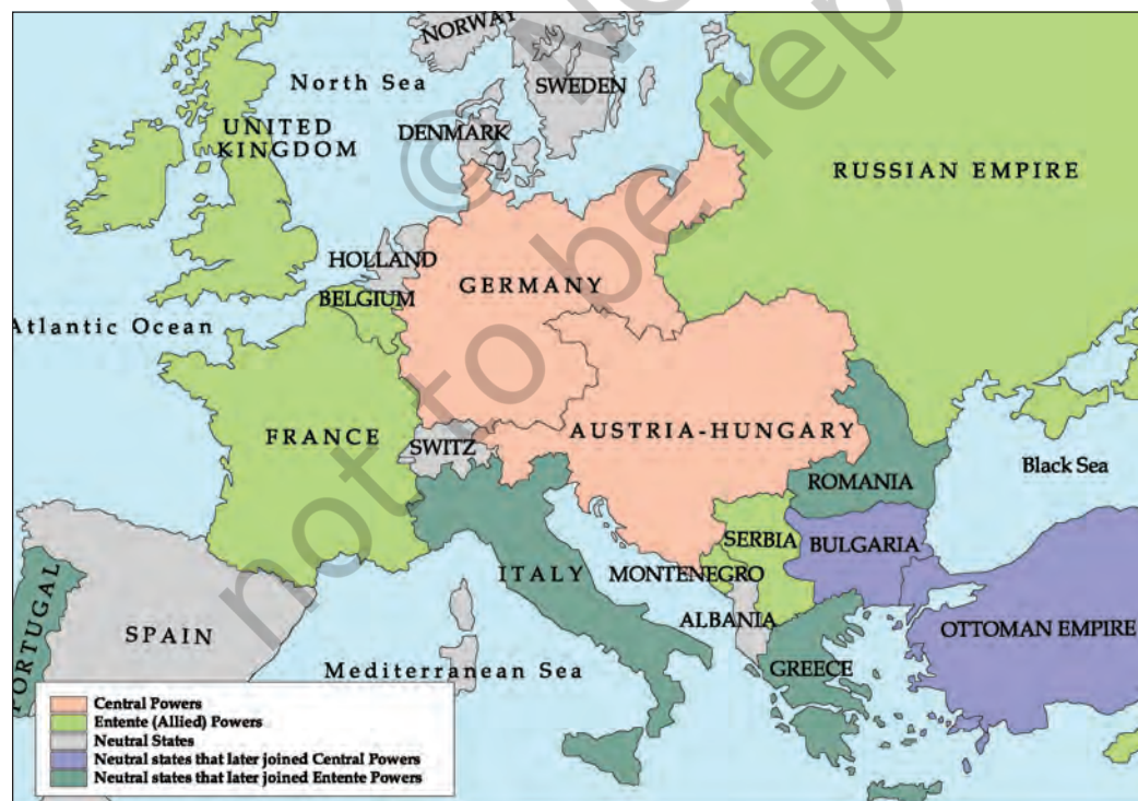
Fig.4 – Europe in 1914.

The map shows the Russian empire and the European countries at war during the First World War.