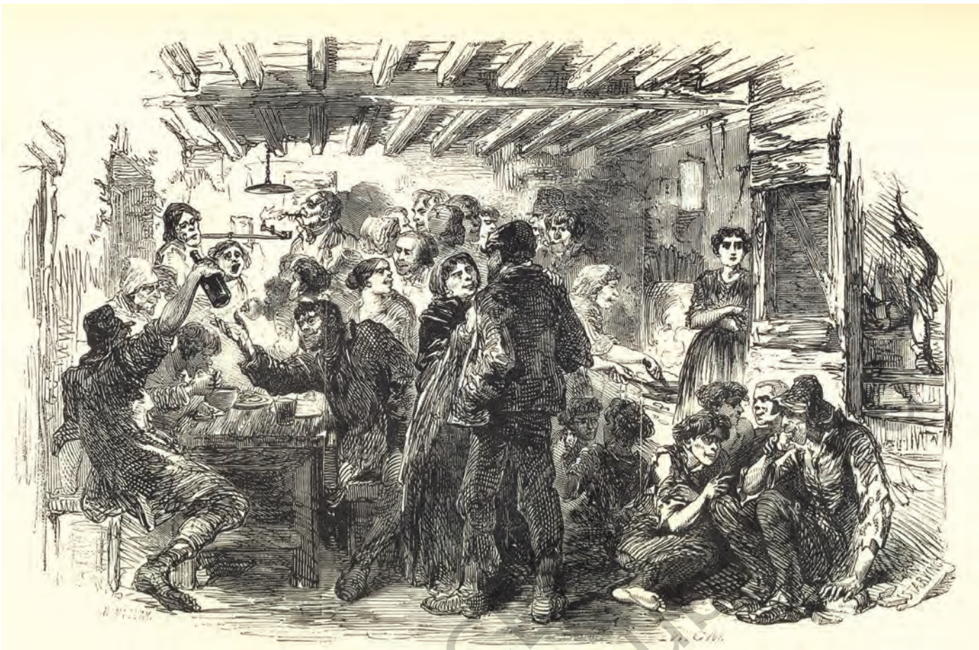
Fig. 1 – The London poor in the mid-nineteenth century as seen by a contemporary. From: Henry Mayhew, London Labour and the London Poor , 1861.

Almost all industries were the property of individuals. Liberals and radicals themselves were often property owners and employers. Having made their wealth through trade or industrial ventures, they felt that such effort should be encouraged – that its benefits would be achieved if the workforce in the economy was healthy and citizens were educated. Opposed to the privileges the old aristocracy had by birth, they firmly believed in the value of individual effort, labour and enterprise. If freedom of individuals was ensured, if the poor could labour, and those with capital could operate without restraint, they believed that societies would develop. Many working men and women who wanted changes in the world rallied around liberal and radical groups and parties in the early nineteenth century.