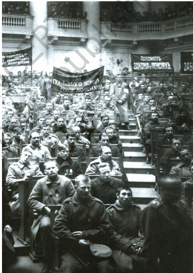
Fig. 8 – The Petrograd Soviet meeting in the Duma, February 1917.

On Sunday, 25 February, the government suspended the Duma. Politicians spoke out against the measure. Demonstrators returned in force to the streets of the left bank on the 26th. On the 27th, the Police Headquarters were ransacked. The streets thronged with people raising slogans about bread, wages, better hours and democracy. The government tried to control the situation and called out the cavalry once again. However, the cavalry refused to fire on the demonstrators. An officer was shot at the barracks of a regiment and three other regiments mutinied, voting to join the striking workers. By that evening, soldiers and