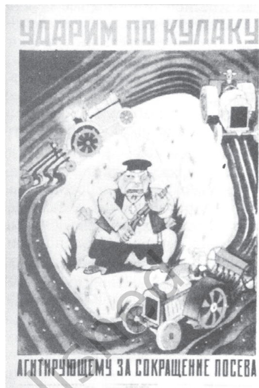
Fig. 18 – A poster during collectivisation. It states: 'We shall strike at the kulak working for the decrease in cultivation.'

Exiled – Forced to live away from one's own country.