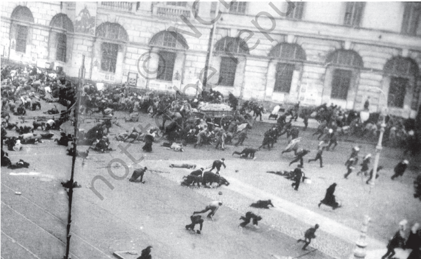
Fig.10 – The July Days. A pro-Bolshevik demonstration on 17 July 1917 being fired upon by the army.