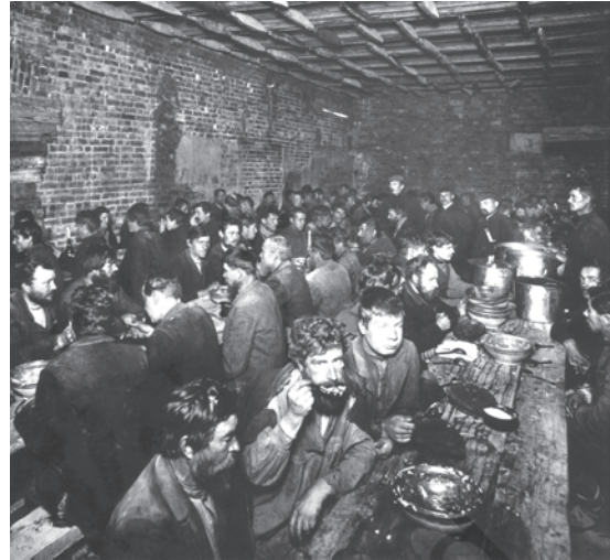
Fig.5 – Unemployed peasants in pre-war St Petersburg.

In the countryside, peasants cultivated most of the land. But the nobility, the crown and the Orthodox Church owned large properties. Like workers, peasants too were divided. They were also