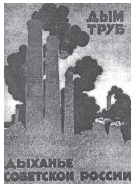
Fig. 14 – Factories came to be seen as a symbol of socialism. This poster states: 'The smoke from the chimneys is the breathing of Soviet Russia.'

An extended schooling system developed, and arrangements were made for factory workers and peasants to enter universities. Crèches were established in factories for the children of women workers. Cheap public health care was provided. Model living quarters were set up for workers. The effect of all this was uneven, though, since government resources were limited.