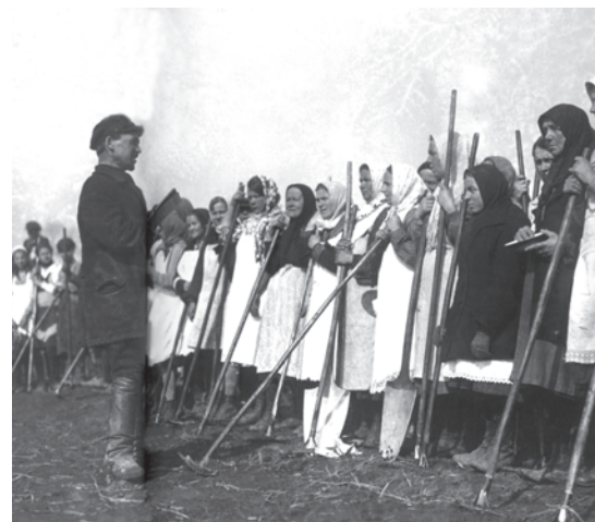
Fig. 19 – Peasant women being gathered to work in the large collective farms.