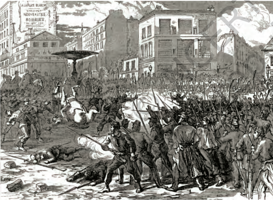
Fig. 2 – This is a painting of the Paris Commune of 1871 (From Illustrated London News, 1871). It portrays a scene from the popular uprising in Paris between March and May 1871. This was a period when the town council (commune) of Paris was taken over by a ‘peoples’ government’ consisting of workers, ordinary people, professionals, political activists and others. The uprising emerged against a background of growing discontent against the policies of the French state. The ‘Paris Commune’ was ultimately crushed by government troops but it was celebrated by Socialists the world over as a prelude to a socialist revolution. The Paris Commune is also popularly remembered for two important legacies: one, for its association with the workers’ red flag – that was the flag adopted by the communards ( revolutionaries) in Paris; two, for the ‘Marseillaise’, originally written as a war song in 1792, it became a symbol of the Commune and of the struggle for liberty.